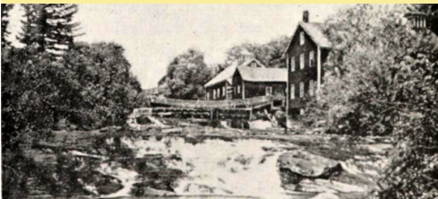
Mills on Miller's Run

The story of the mills and water privileges in the village was a complicated and changing one. This part of town had been part of Sheffield and was allocated to Wheelock, so that the latter could have better water power. It gave rise to the saying "Wheelock got Sheffield's boot and it was a good piece of town cobbling."